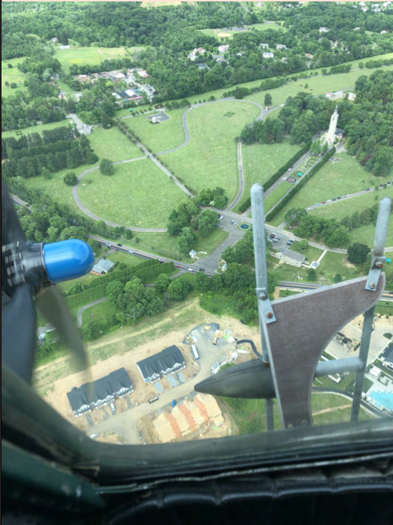
Whitemarsh Memorial Park from the cockpit of "Whiskey 7"