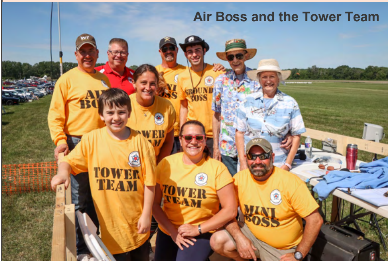
Air Boss and the Tower Team